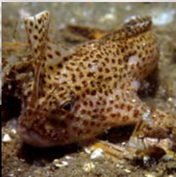
The critically endangered Spotted Handfish ( Brachionichthys hirsutus ) is only found in the Lower Derwent estuary and related bays, including Ralphs Bay.

the critically endangered Spotted Handfish feeding and breeding unseen on the bay's sandy bottom, as well as the microscopic life forms which play a critical role in ecosystem health. We thank you for purchasing this calendar. By this action alone, you will assist us to demonstrate that our coastal bays and water ways are much, much more than a real estate opportunity. Tasmania's bays and beaches belong to no single person, State Government or corporation, they belong to us all and the generations to come. We hope that, if you have never visited Ralphs Bay, this calendar will help paint a picture of its true value. Visit us at www.saveralphsbay.org and, tell your friends.