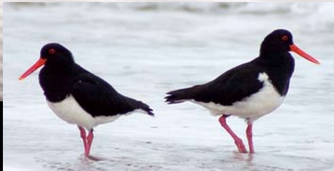
The Pied Oystercatcher ( Haematopus longirostris ) lives and breeds along Australia's coastal fringe. Ralphs Bay is home to an estimated 600 Pied Oystercatchers over the course of a year.