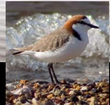
The Red-capped Plover ( Charadrius ruficapillus ) is another Ralphs Bay regular.