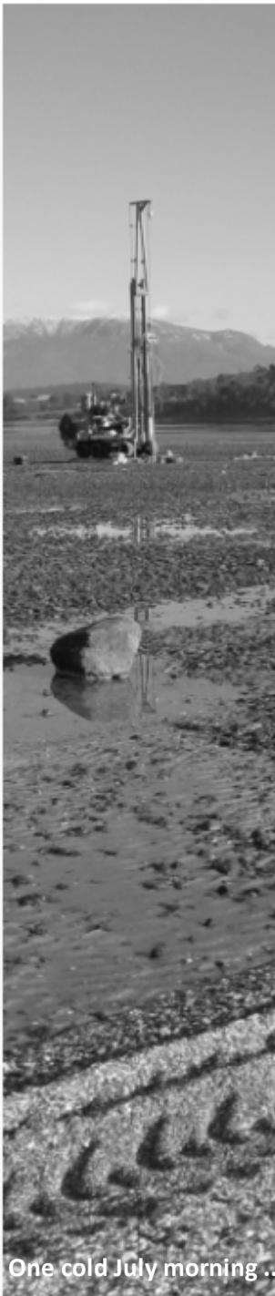
One cold July morning ...