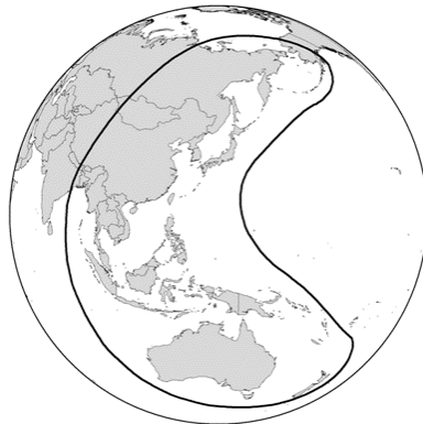
Figure 1: East Asian-Australasian flyway (prepared by Wetlands International)

Most of the 36 migratory shorebird species breed in the northern hemisphere and migrate to the non-breeding grounds of Australia along the East Asian-Australasian flyway (EAA flyway). The EAA flyway stretches from Siberia and Alaska, southwards through east and south-east Asia, to Australia and New Zealand (see figure 1). The major exception to this rule is the Double-banded Plover, which migrates between Australia and its breeding grounds in New Zealand.